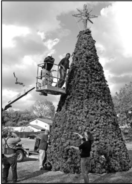
Tree was purchased from Arnett Marketing