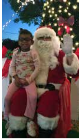
Children Shared Their Wish Lists with Santa Claus at the Lighting of the Lights.