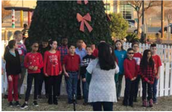
The Christian School at Castle Hills Middle School Choir Sang the Songs of the Season at the Lighting of the Lights.