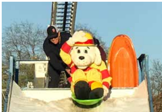
Sparky the Fire Prevention Dog Joined in the Fun Sledding.