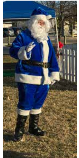
Blue Santa greets visitors at the Commons at the Annual Lighting of the Lights.

DOUBLE PANE WINDOWS • MIRRORING WALLS REPLACEMENT GLASS • SHOWER ENCLOSURES GLASS TABLE TOPS