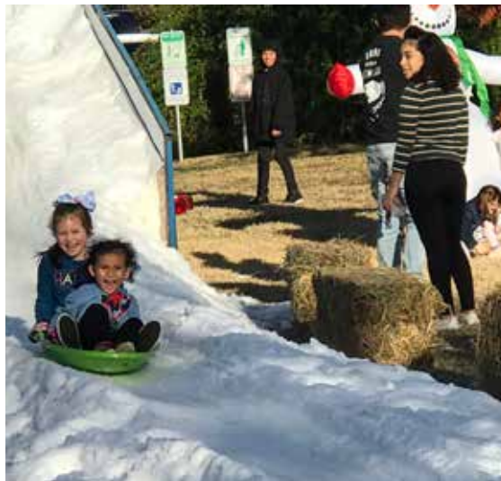
Everyone Was All Smiles When Sledding During the Lighting of the Lights!