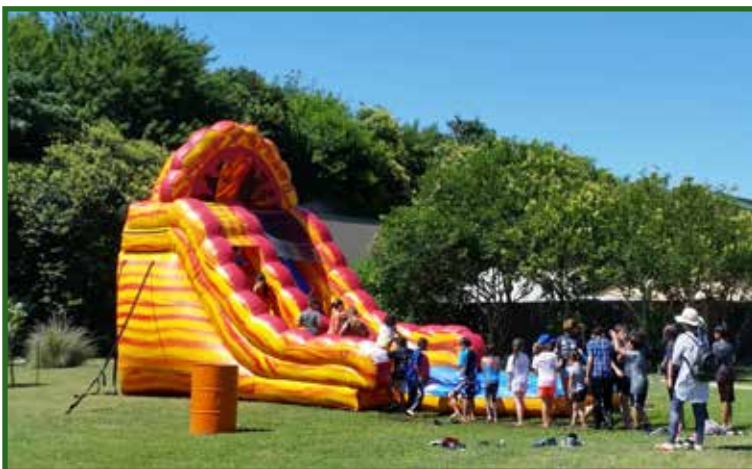
The Castle Hills Community Organization hosted an End of School party in the Commons on the last day of school. Students from across the community joined in the fun with bounce houses, waterslide, soccer kick, and refreshments.