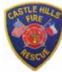
Chief Riedel Castle Hills Fire Department

These and other safety tips can be found at the National Fire Protection Association website: www.nfpa.org/public-education