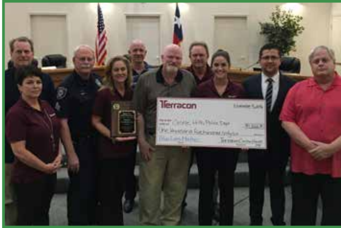
At the November City Council meeting, Terracon Consultants presented a check for $1,566 to the Castle Hills Police Department in support of "Blue Lives Matter".