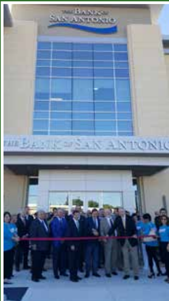
Ribbon Cutting on September 15, 2016 at the new Bank of San Antonio Headquarters located at 1900 NW Loop 410.