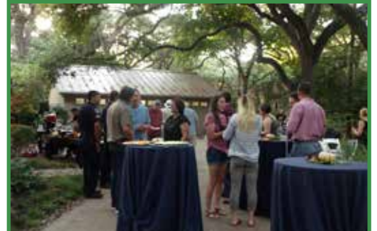
Fox Hall neighbors gather at the Baker's to support Castle Hills crime prevention efforts on NNO.