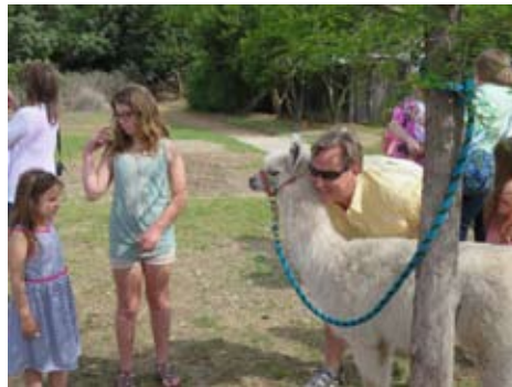
Community Easter Egg Hunt sponsored by the CH Community Organization