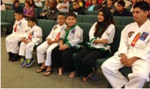
Karate Kids of America were recognized at the May 13th City Council Meeting.