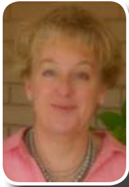
Stacia Spridgen Place 2

The question of continuing VIA service in Castle Hills can only be resolved by a public vote. VIA provides bus service to approximately 285,000 riders (in an average year) who board the buses at Castle Hills stops on major arteries that connect our city to the wider San Antonio community, as well as, VIATrans services to Castle Hills residents needing special transportation accommodations.