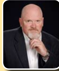
Tim Howell Mayor