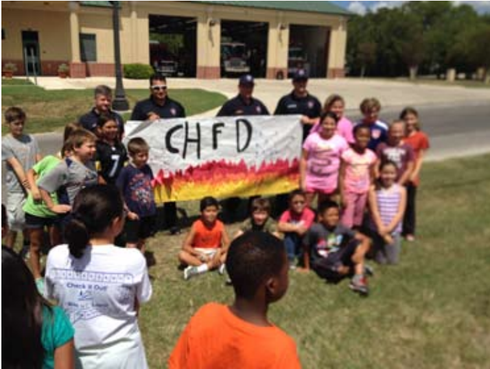
Castle Hills Elementary students honor CH Fire Department on September 11th.