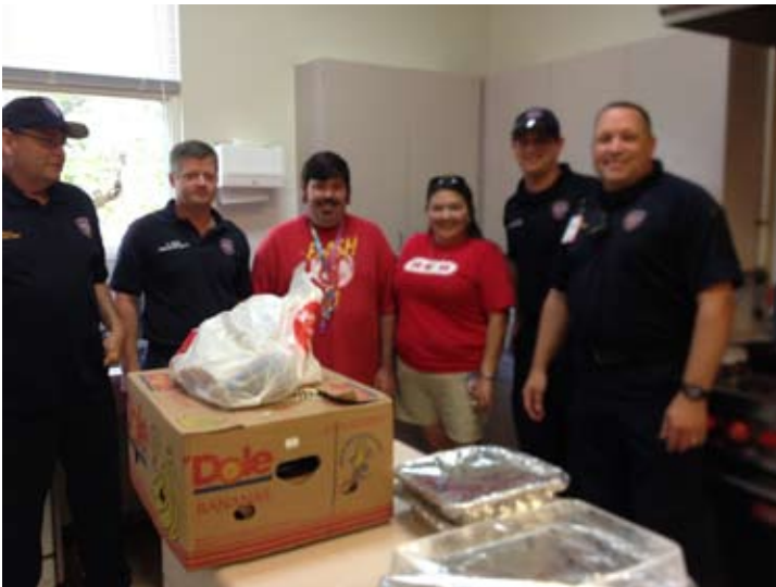
HEB Store 389 partners honored the police and fire departments with delicious meals on September 11th.