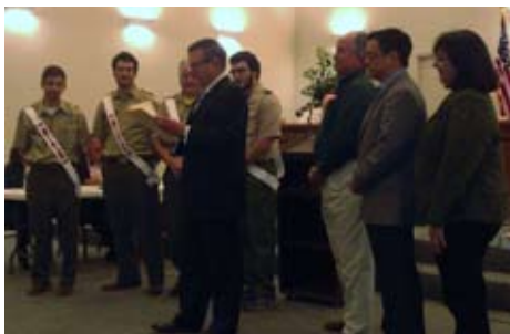
Order of the Arrow Scouts helped clear seven tons of brush on City property January 25, 2014. They were recognized for their contributions to the community at the February 11, 2014 City Council Meeting.