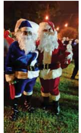
Blue and Red Santa spread holiday cheer with young and old at the "Lighting of the Lights".