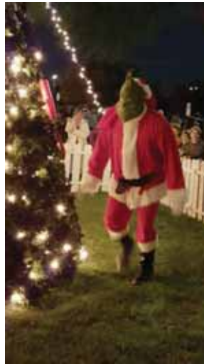
The Grinch tries to dampen the holiday spirits by turning off the lights on the tree at the "Lighting of the Lights" on December 1 st .