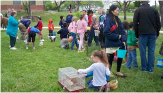
Annual Easter egg hunt at the Commons.