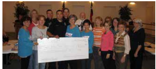
Castle Hills Women's Club presenting a check to the Castle Hills Police Department for the purchase of new exercise equipment.