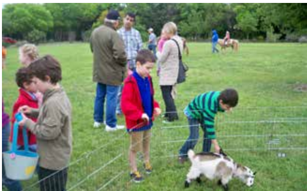
Annual Easter egg hunt at the Commons.