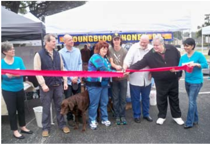
Ribbon Cutting at the Farm to Market Grand Opening Sunday, February 8, 2015