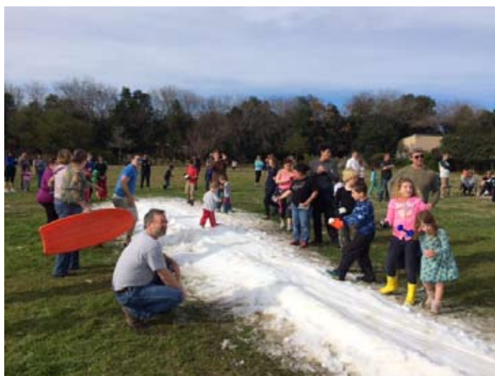
Castle Hills Community Organization hosts Snow Day