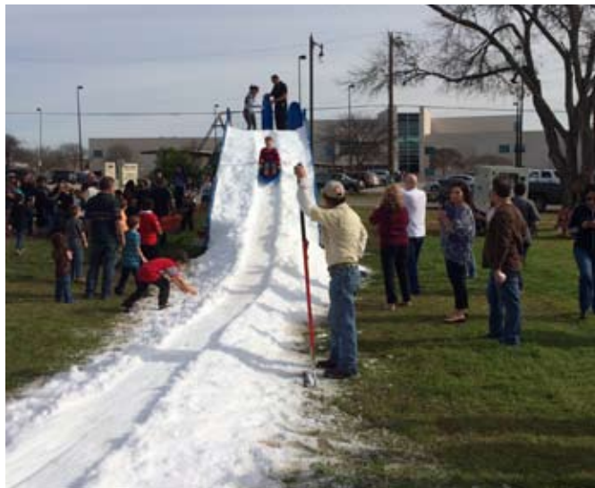
Snow!!! Snow Day in Castle Hills