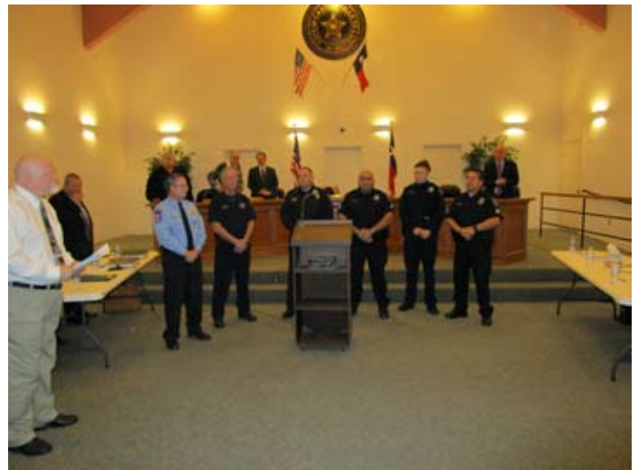
Castle Hills First Responders being honored with a Proclamation Recognizing Entities Involved in the Wedgwood Fire