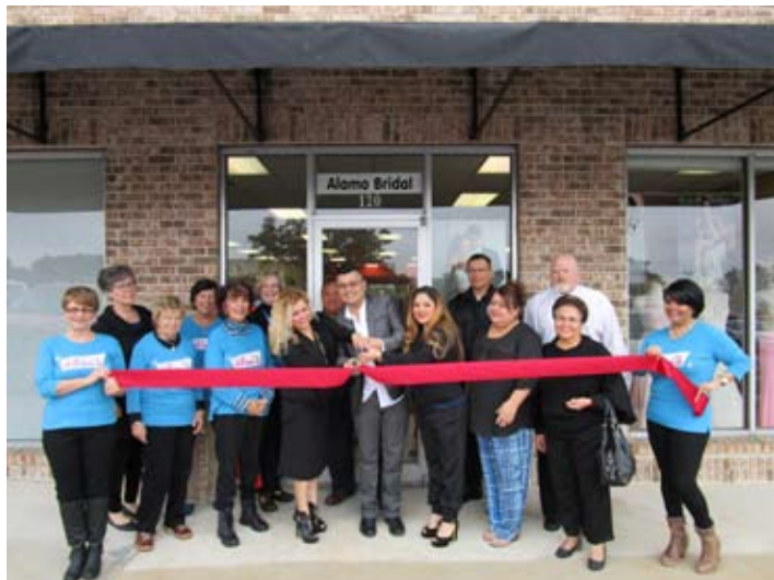
Ribbon Cutting at Alamo Bridal Shop's Grand Opening