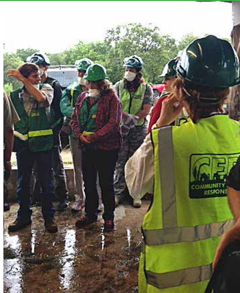
Sixteen Castle Hills Residents Participated in the June Community Emergency Response Teams (CERT) Training Which Included Basic Disaster Response Skills including First Aid, Search and Rescue, Fire Suppression, and Team Organization.