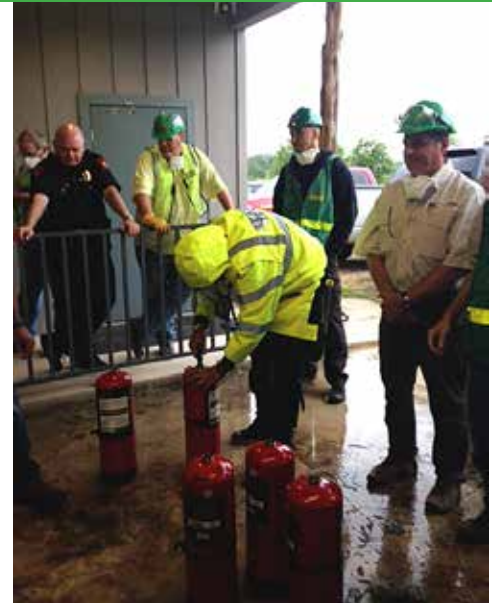
CERT Training Participants Practice Fire Suppression at the McGimsey Scout Camp as Part of the Three Day Training Class.