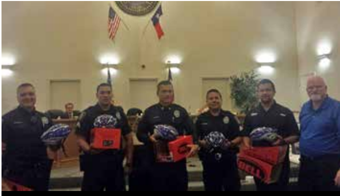
Castle Hills PD "Asphalt Caballeros" bicycle team for the MS 150 Valero Ride to the River gearing up with new helmets.