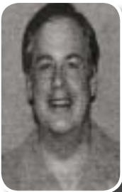
Douglas Gregory Place 2