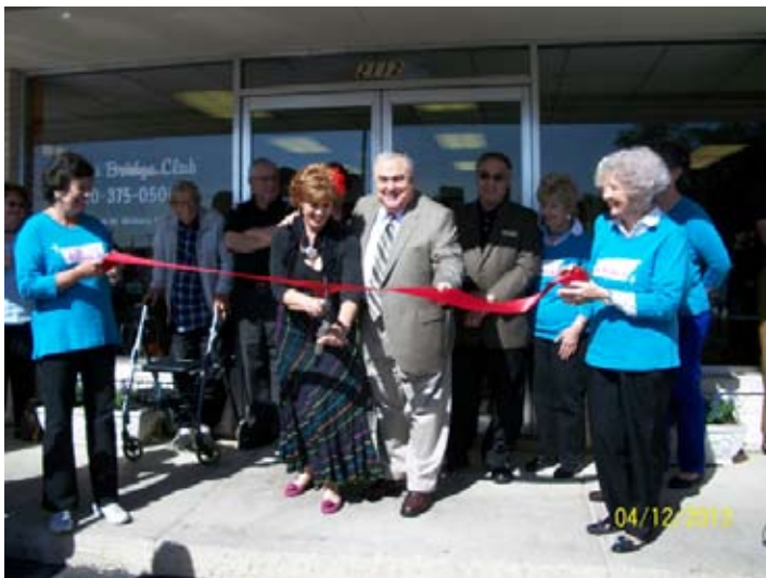
Fiesta Bridge Club , 2112 NW Military Hwy. celebrated their grand opening and ribbon cutting ceremony on April 12th.