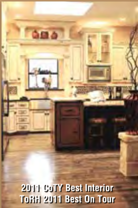
2011 CoTY Best Interior ToRH 2011 Best On Tour