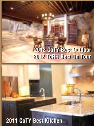
2012 CoTY Best Outdoor 2012 ToRH Best On Tour