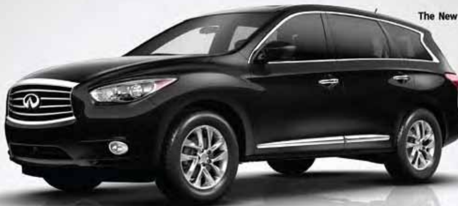
The New Infiniti JX

Not only do we provide you with a relaxing and luxurious car-shopping experience from the moment you walk into our showroom, our One Simple Price® promise means we won't waste your time with negotiations. And we do it for a very important reason: If you have to negotiate, it isn't a luxury experience.