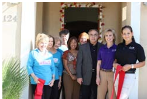
NeuroRestorative, 124 S. Winston held their ribbon cutting ceremony November 19th.