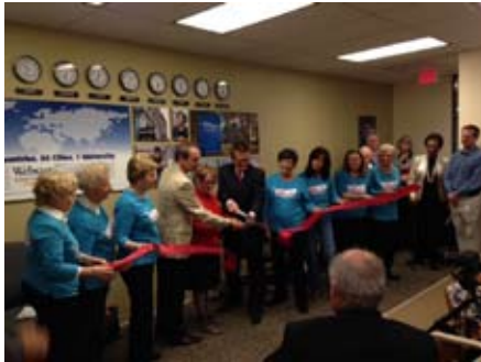
Webster University located at 1100 NW Loop 410 celebrated their grand opening and ribbon cutting ceremony on October 22nd.