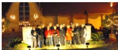
Garden Club members gathered at City Hall by the Christmas lights they gave to City Hall.