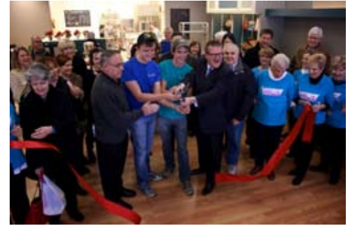
C'est La Vie Baking Co, 8055 West Ave., #107, celebrated their Grand Opening & Ribbon Cutting Ceremony on December 6th.