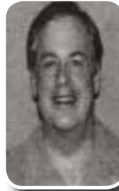
Douglas Gregory Place 2

During my first few months as your elected official, I have tried to remain positive and enthusiastic about public service. I try not to be negative about an issue. I try to see the total picture on issues taking into account the economic and social well-being of our city. Regarding issues brought to the council, I have and will continue to assess what is in the best long term public interest of our city as a whole and for our individual citizens.