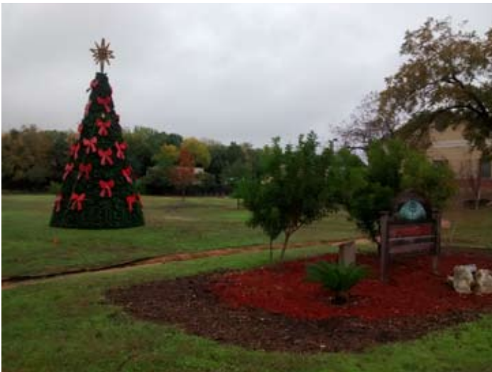
The Christmas tree sets the stage for the holiday season in the recently landscaped Commons.