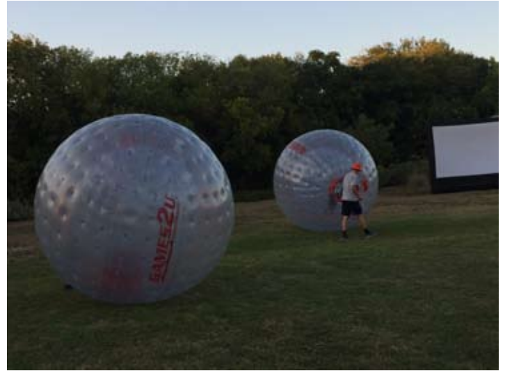
During the Halloween Carnival residents enjoyed rolling around the Commons in "The Game Ball"