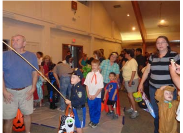
Trick or Treaters line up to "fish".

Enjoy all the comforts of home in a 4 bedroom 2.5 bath home near the Quarry, downtown and Fort Sam!