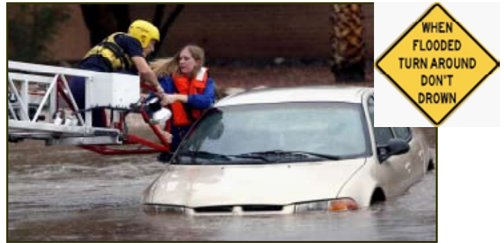
Be Safe: Do not drive around barricades or attempt to drive through storm water!