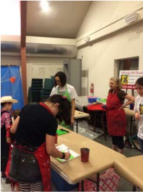
Whimsey Art Studio hosts an art booth for the resident ghosts and goblins at the Halloween Carnival.