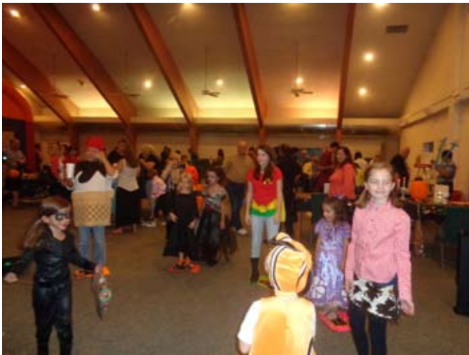
Residents enjoyed the Halloween Carnival Cake Walk.