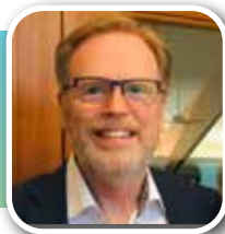
JACK JOYCE PLACE 4