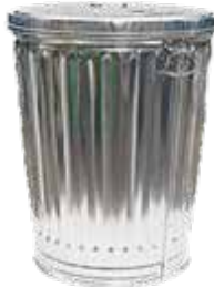
Metal Container with Handles and Lid