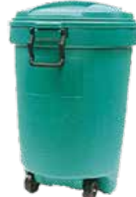
Wheeled Plastic Container with Handles and Lid