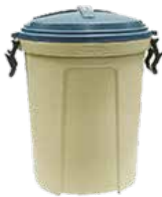
Plastic Container with Handles and Lid