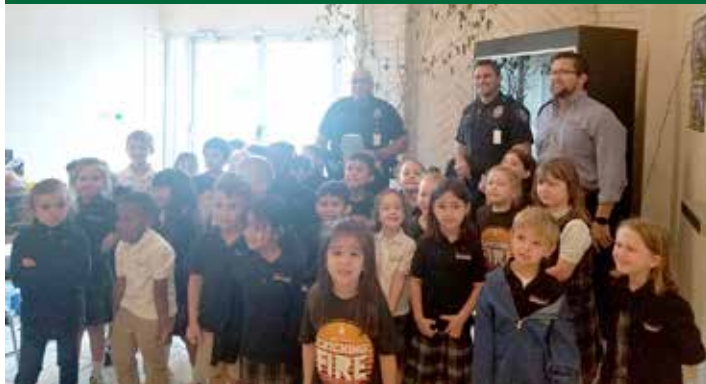
Ribbon Cutting Event