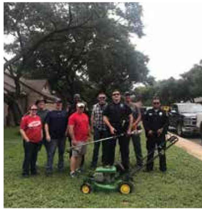
Officers and Dispatchers coming together on a Saturday to help with the lawn work for the injured officer at his home.

This tragedy has strengthened the resolve of the members of the police department to continue to arrest drivers, who are intoxicated, in an effort to keep the community safe. Remember to plan while you can and have arrangements made if you are going to consume alcoholic beverages and need a means to get home. Please do not Drink and Drive.