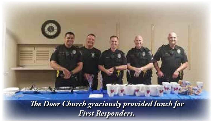
The Door Church graciously provided lunch for First Responders.